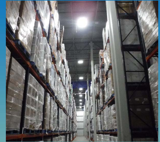
LED High-Bay Lighting