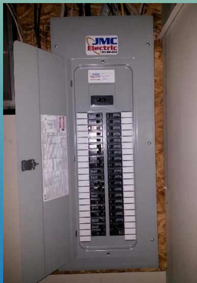
200 Amp Electrical Panel