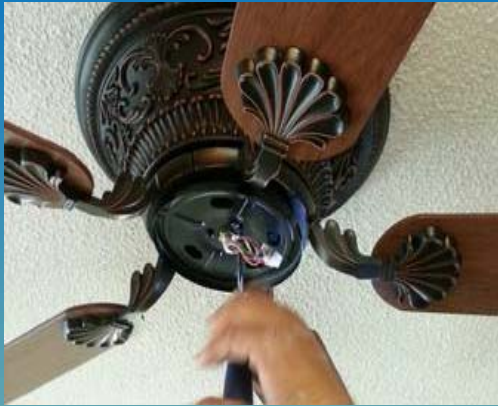
Ceiling fan installation